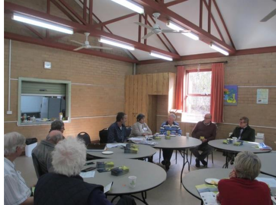
Heritage Trail information day

As can be seen by the committee members above, they all have duties with other organisations and this may be why BMACHO has not held many general meetings, in the past as most of the committee members have duties with other organisations.