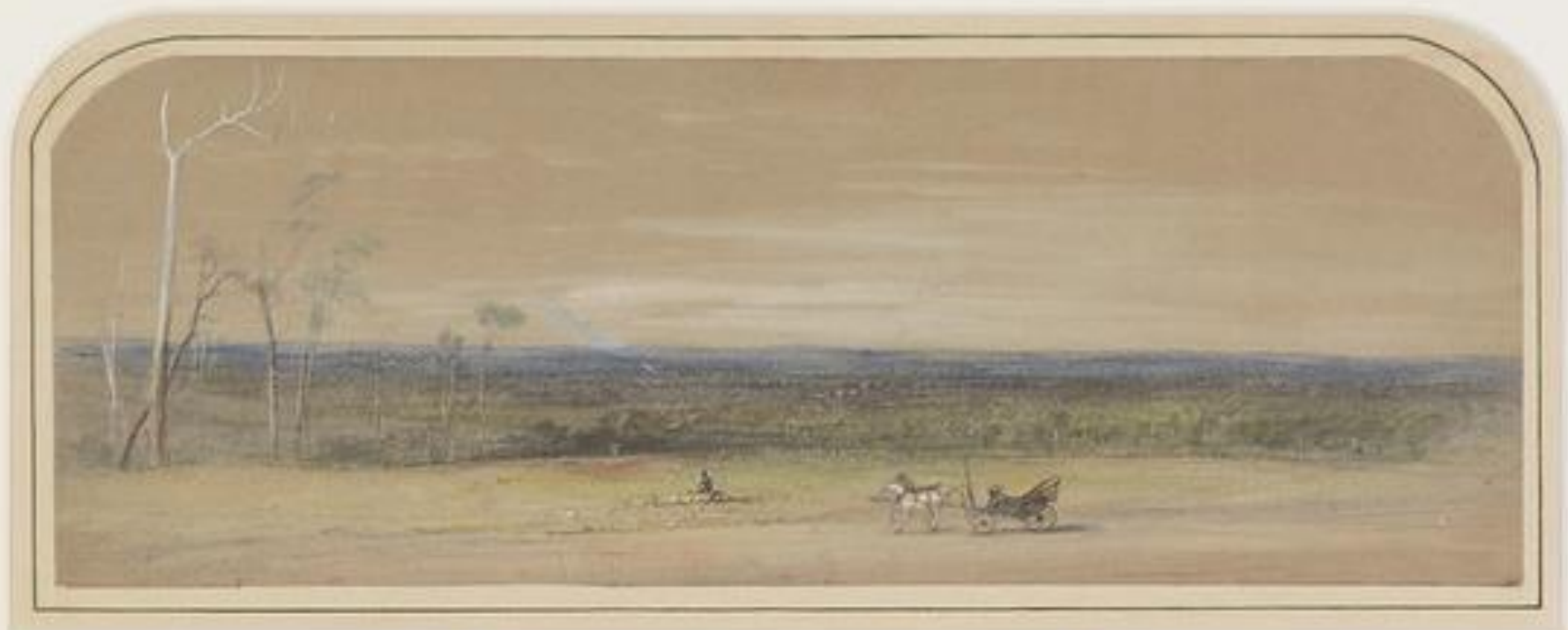
SPRINGWOOD MILITARY STATION NEW SOUTH WALES. G.W. BRIERLY, DEL.