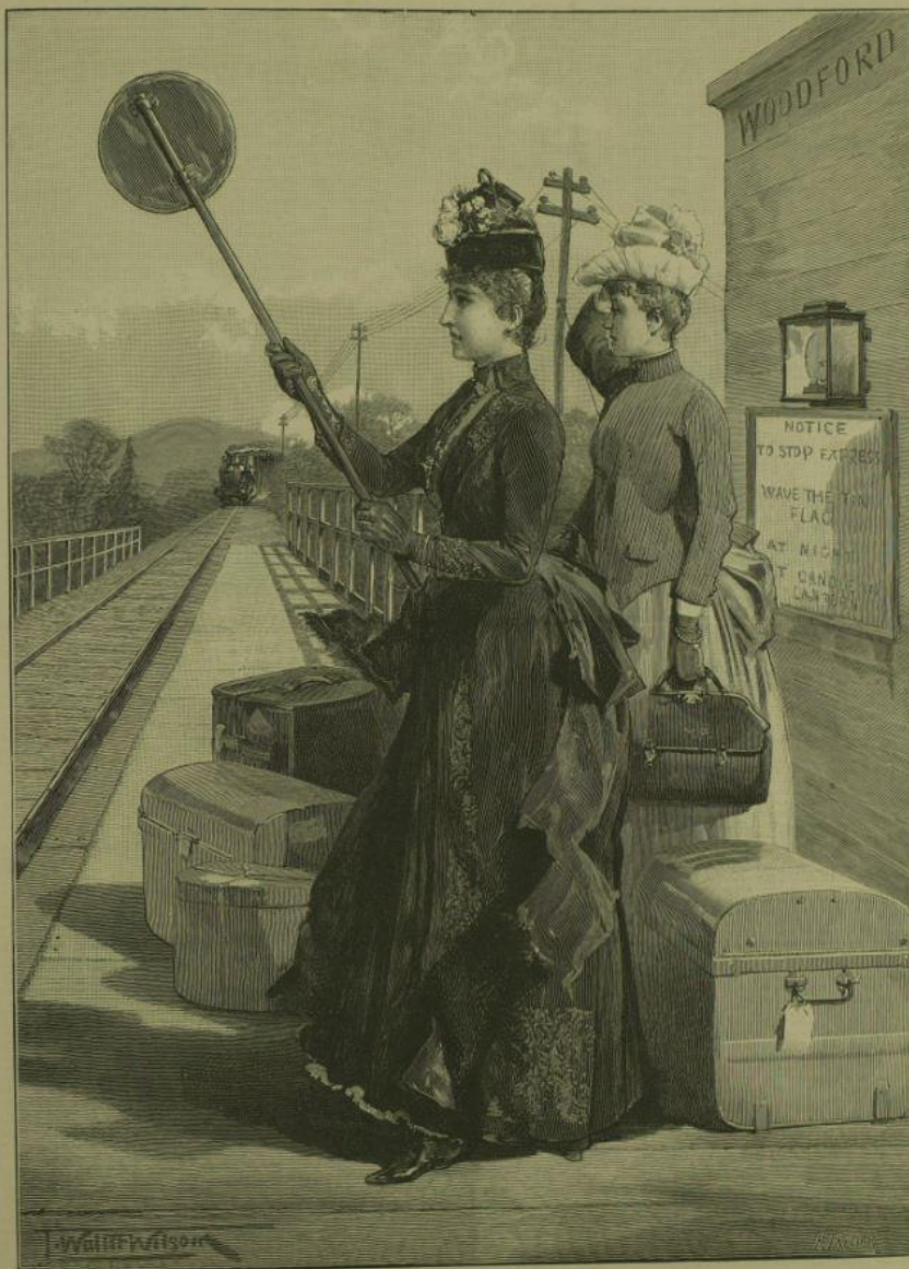
CHRISTMAS IN AUSTRALIA: STOPPING THE TRAIN TO GO TO A CHRISTMAS PARTY.

Melbourne has, on the Yarra bank, a long series