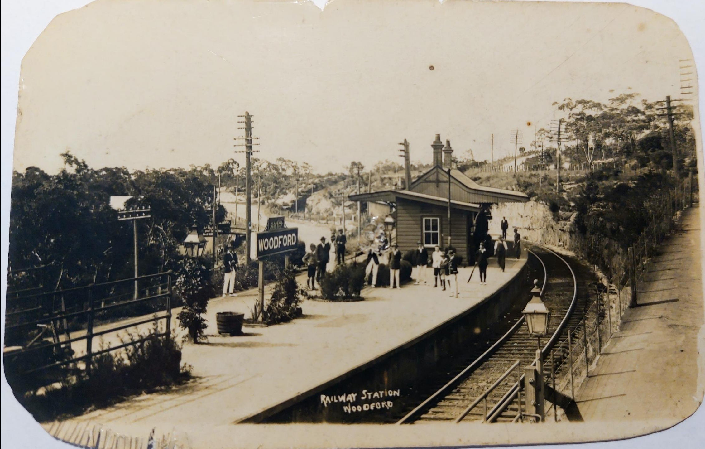
RAILWAY STATION WOODFORD