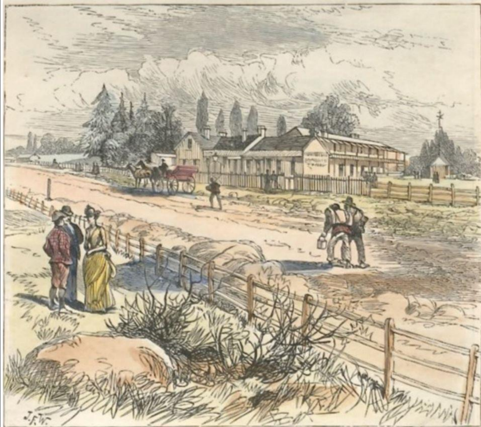
WOODFORD HOUSE, IN THE BLUE MOUNTAINS, NEAR SYDNEY.