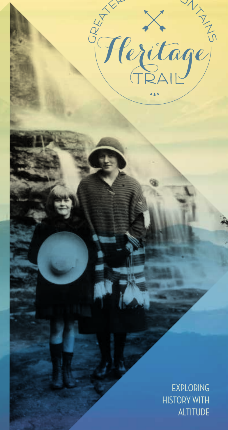
EXPLORING HISTORY WITH ALTITUDE

Please visit and enjoy these unique heritage resources – come for the day – come for the weekend. Stay at one of the businesses associated with our history and cultural heritage or have lunch or dinner at one of the historic restaurants or cafés.